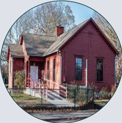
North Kingstown Food Pantry