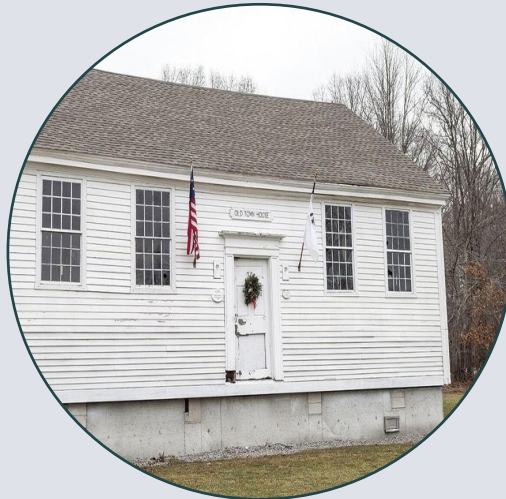
Old Town House